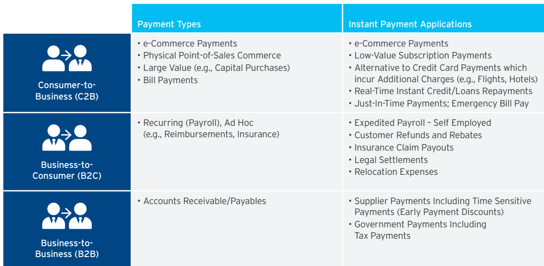
Figure 1. Example use cases for real-time payments